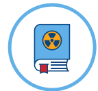
ACQUISITION OF EXPERTISE