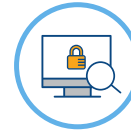
TESTING OR PROBING OF SECURITY