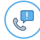
EXPRESSED OR IMPLIED THREAT

The NSI is a joint collaborative effort by DHS, the Federal Bureau of Investigation, and federal, state, and local law enforcement partners. It establishes standard processes and policies that allow law enforcement and homeland security agencies to share Suspicious Activity Reports through an information-sharing system. The initiative was set up in a manner that protects a person's privacy, civil rights, and civil liberties. To learn more, visit www.dhs.gov/NSI .